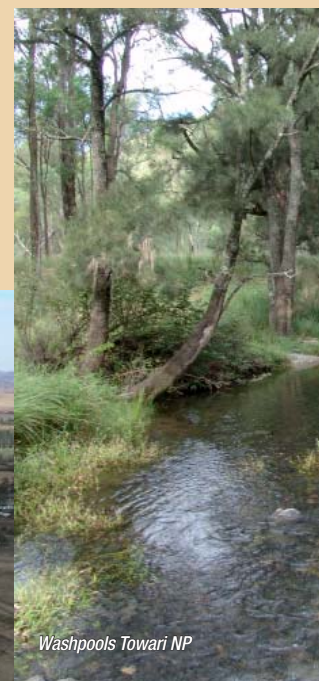
Washpools Towarri NP