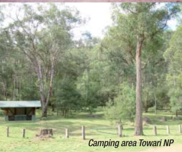
Camping area Towarri NP