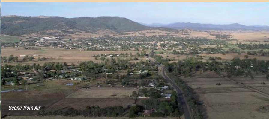
Scone from Air