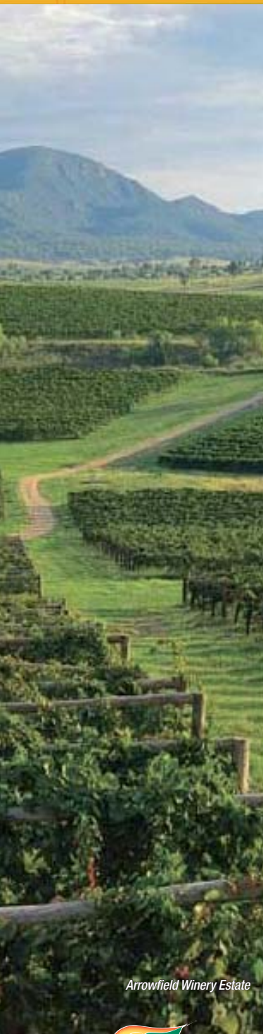
Arrowfield Winery Estate