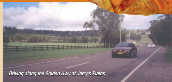
Driving along the Golden Hwy at Jerry's Plains

Leaving Denman take the Rosemount Road . This loop takes you through vineyards along the Goulburn River and bushland adjoining the Wollemi National Park;