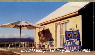
David Mahony Art Gallery al fresco coffee