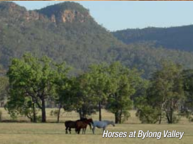
Horses at Bylong Valley